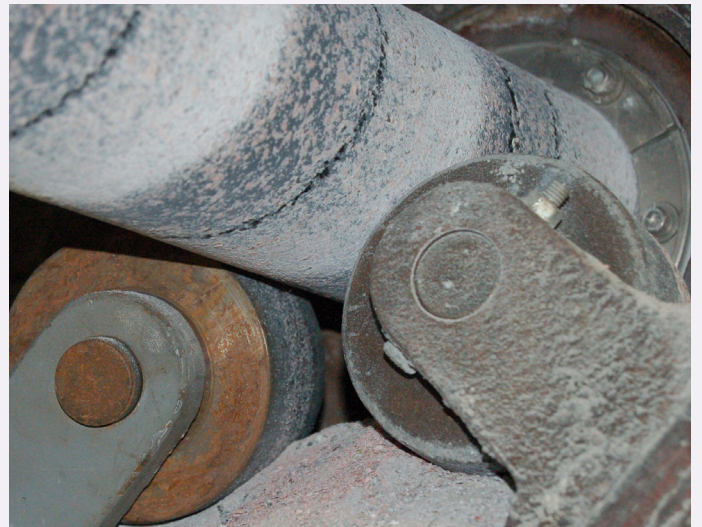
Figures 2-3. Sootblower lance footage