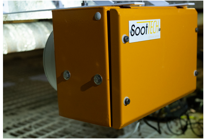
Figure 1. VooDoo box with integrated camera

VooDoo will assist in pushing the boiler beyond its technical specification by analyzing visual carry-over data. A tool that controls liquor flow and temperature and, when used in conjunction with HISS™, allows for intelligent control and optimization of steam sootblowing. The tool provides an early warning system to prevent plugging in the boiler.